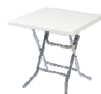
Square White - $30