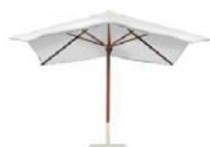
Large Market Umbrella - $90