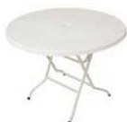
Plastic Garden - $20